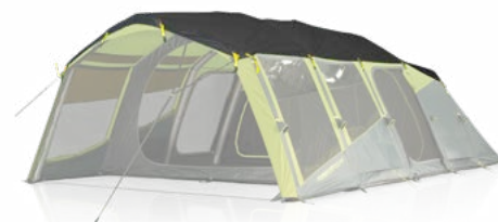
Evo TXL V2 Roof Cover