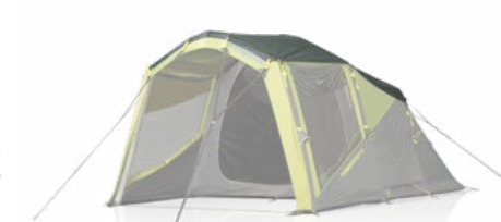
Evo TS V2 Roof Cover