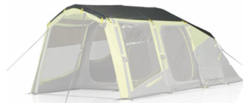
Evo TM V2 Roof Cover