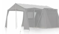
Atlas Roof Cover