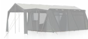
Titan Roof Cover